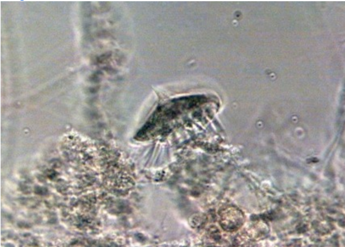
A crawling ciliate typical of mature activated sludge. (400X)